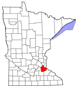
Location Map of Dakota County Minnesota