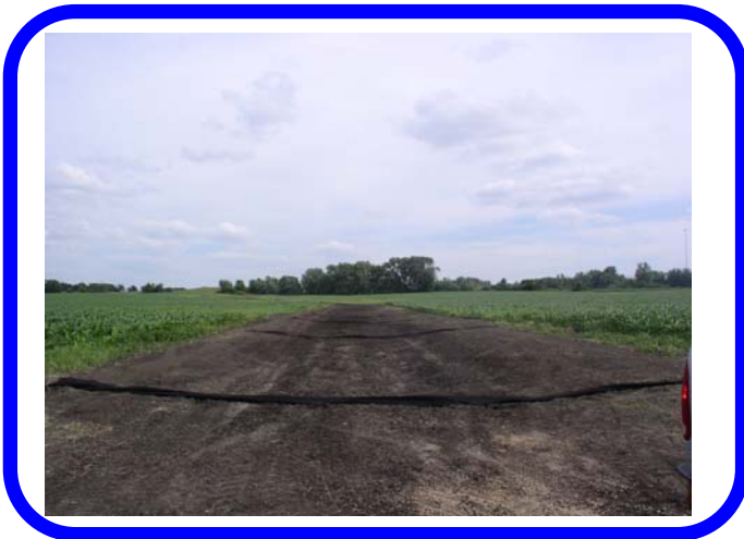
View from the base of the slope prior to work