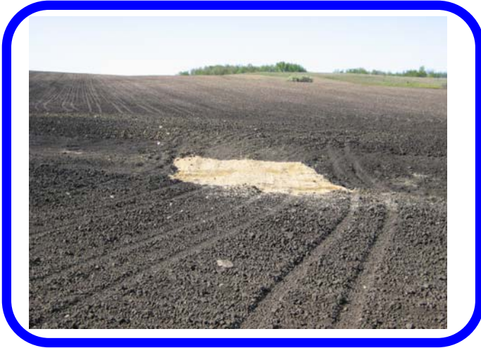
Side view of line waterway