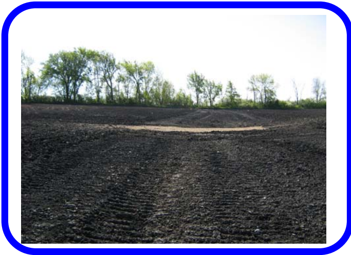
View from bottom in the finished grass waterway